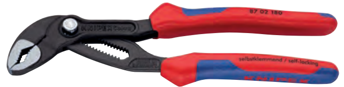
87 02 180 T