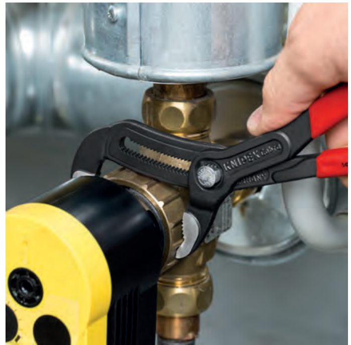
Teeth set against the direction of rotation have a self-locking effect and prevent slipping on the workpiece.