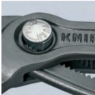
Fine adjustment by pushing a button: fast and comfortable

KNIPEX Cobra® – the Hightech Water Pump Pliers. No more time-consuming presetting of the required opening size. Just position the upper jaw to the workpiece, push button and move close the lower jaw, ingeniously simple.