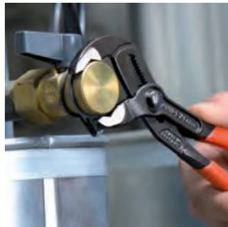
Fast and firm adjustment directly on the workpiece