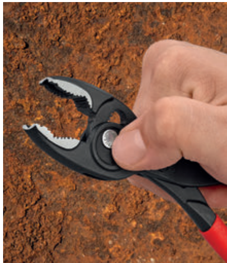
...and the position to be changed quickly at the touch of a button!