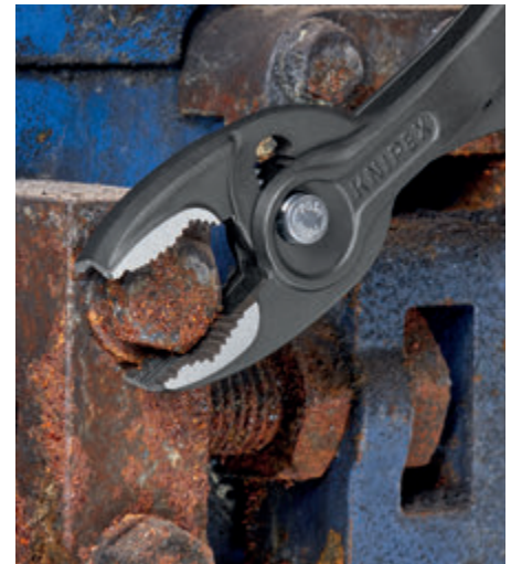
The box-joint is robust and flexible, so that the pliers can hold workpieces between 4 and 22 mm in place.