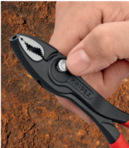
The KNIPEX TwinGrip allows the gripping capacity to be set flexibly in five positions...

Optimised jaw geometry: 2-zone gripping jaw with opposing alignment of teeth – for maximum grip when loosening and tightening.