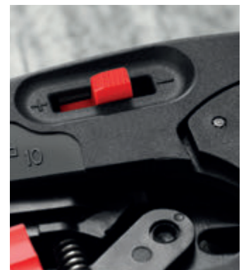
The fine adjustment feature allows reliable stripping in all operating conditions like extreme temperatures or special insulating material.