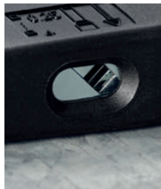
Square crimping die for wire ferrules of 0.25 – 4 mm 2 .