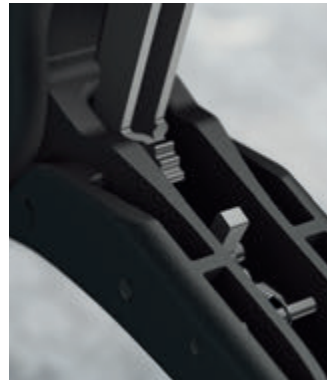
The ratchet crimping mechanism ensures the correct crimping pressure.