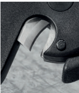
With cable cutter for conductors up to 10 mm 2 .