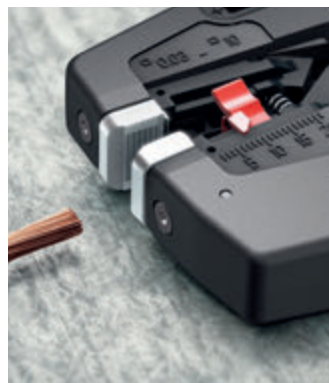
Automatic stripping up to 10 mm 2 .