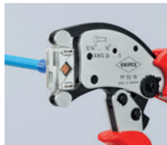
Uniquely flexible: connectors can be inserted in the rotatable crimp head from almost any position