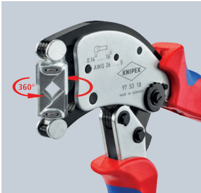
Crimp head can be rotated 360° for optimal accessibility, even in confined spaces