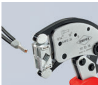
Twin wire ferrules up to 2 x 6 mm 2 can be crimped without adjustment