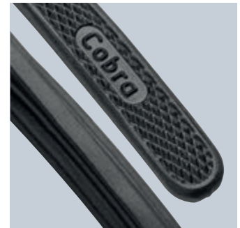
Naked truth: The grips are not coated to keep them as slim as possible. To ensure good grip, they are texturised on the outside