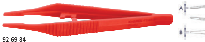
92 69 84