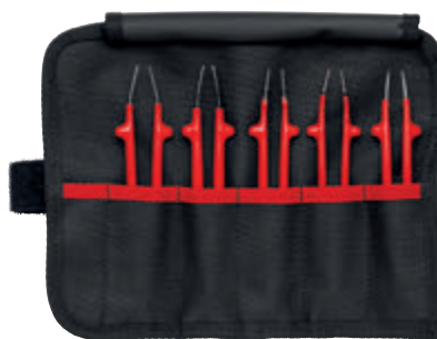
92 00 04