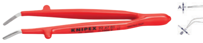
92 47 01