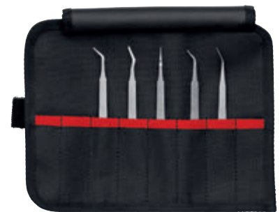
92 00 03