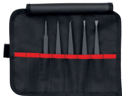
92 00 05 ESD