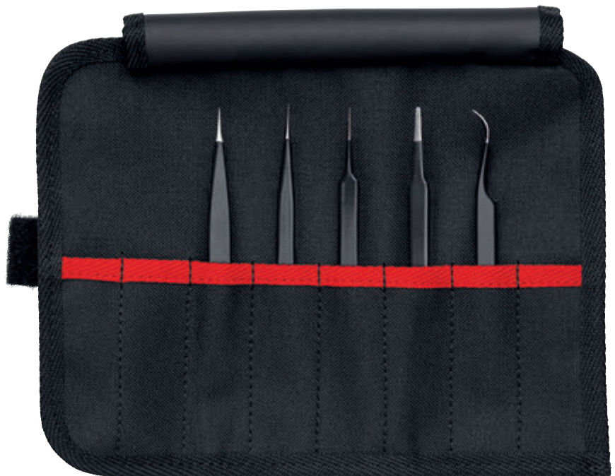
92 00 01 ESD