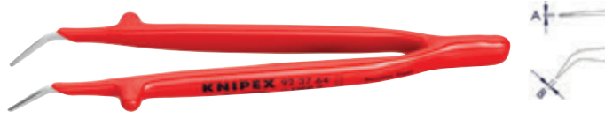
92 37 64