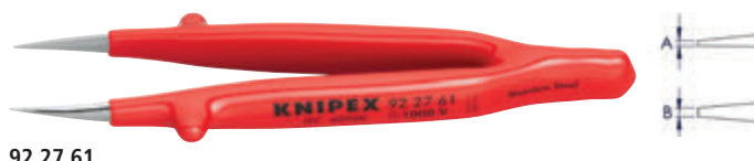
92 27 61