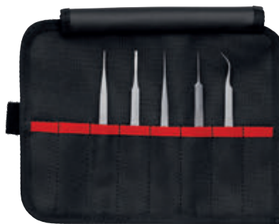
92 00 02