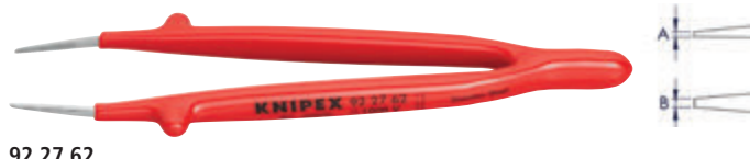
92 27 62