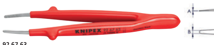
92 67 63