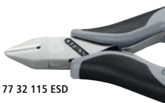
77 32 115 ESD