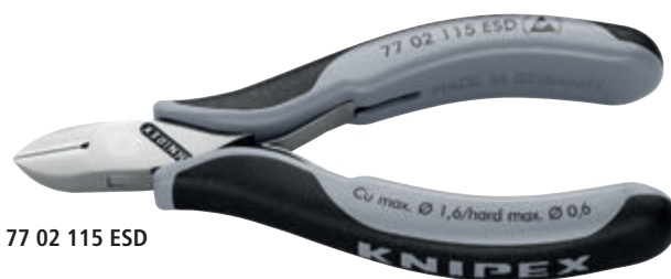
77 02 115 ESD