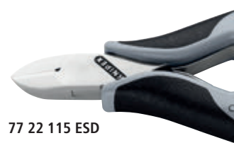
77 22 115 ESD