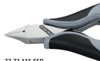
77 72 115 ESD