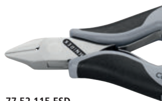
77 52 115 ESD