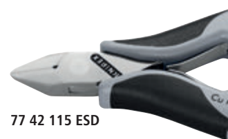
77 42 115 ESD