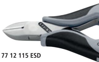
77 12 115 ESD