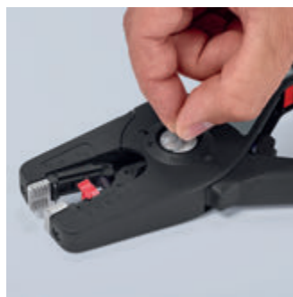
For special requirements, such as particularly hard or soft insulation materials, optimum fine adjustments can be made using the adjusting wheel with its tactile locking positions