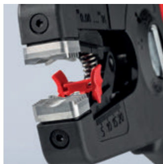
Semi-circular grooved holding clamp for better grip that holds practically any insulation material securely in place