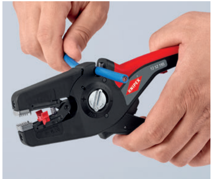
With cable cutter on the top side for up to 16 mm 2