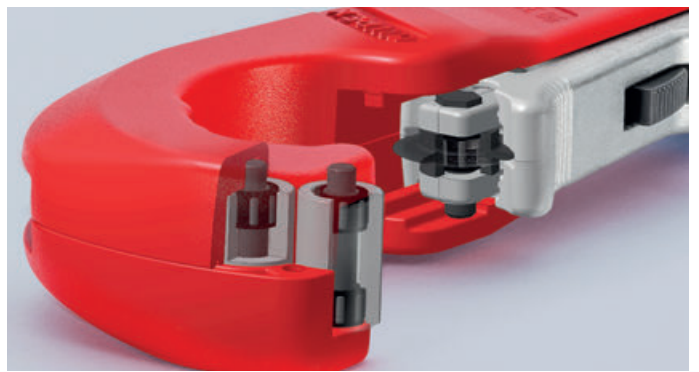
High-quality needle bearings enable the cutting wheel and the four guide rollers to operate virtually without any friction during the cutting – cuts stainless steel pipes with particular ease