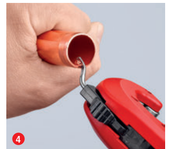
4 and you're done! If necessary, have the edge smoothed out using the fold-out deburring tool – with surprisingly little effort