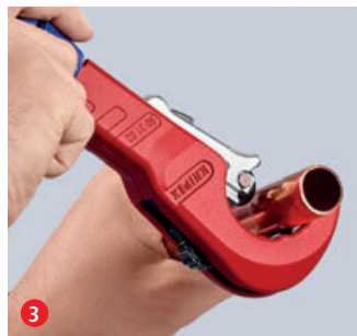
3 Tighten and cut with a swift twist and then readjust using the ergonomic blue feeding barrel...