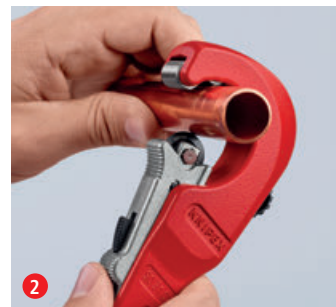
2 Push the cutting wheel against the pipe with the QuickLock single hand quick adjustment: fastest adjustment to different pipe diameters