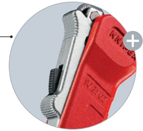
The spring-loaded cutting wheel can be pushed and fixed on the diameter of the pipe with the single-handed quick adjustment