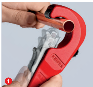
1 Cutting now made easy: position the opened KNIPEX TubiX®...