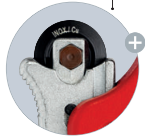
The needle-bearing and spring-loaded cutting wheel made of high-quality ball bearing steel is easily exchangeable