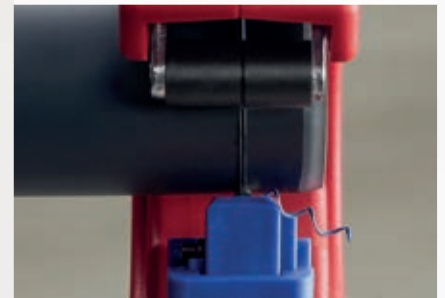
Segments as short as 10 mm can be cut. The spiral chip comes from chamfering.