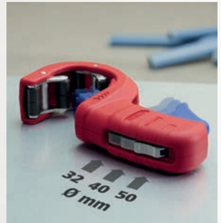
Three diameters with one tool: the pipe diameter can be preset with the metal adjuster.