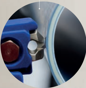
Once in place, the spring-loaded blade exerts enough pressure for the cut – no readjustment necessary!