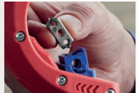
When worn, the blade can be reversed or replaced without the need for tools.